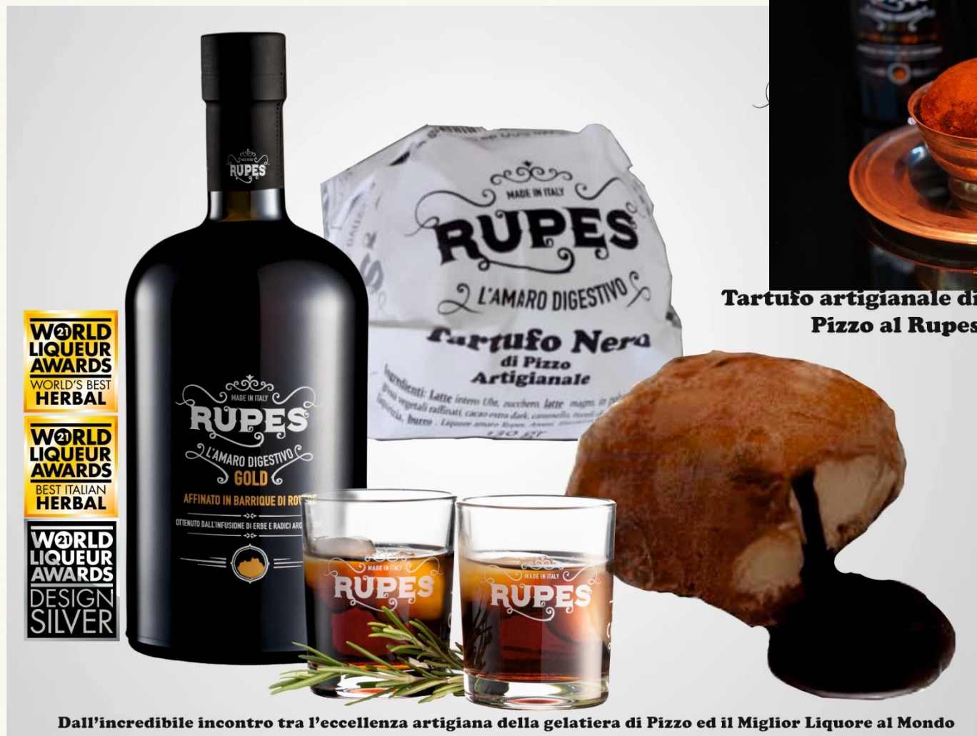
Tartufo artigianale di Pizzo al Rupes

Dall'incredibile incontro tra l'eccellenza artigiana della gelateria di Pizzo ed il Miglior Liquore al Mondo